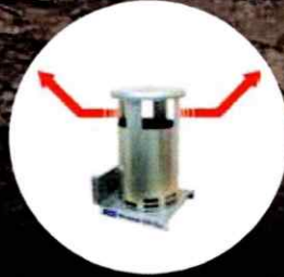
Unique top design provides superior distribution of heat