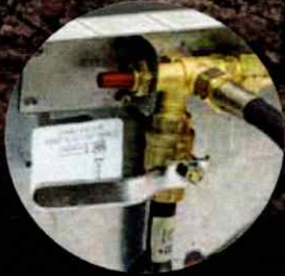
Adjustable output control for maximum fuel efficiency

These standard duty convection heaters feature adjustable output control to save fuel, and a unique top design for superior heat distribution. Workman™ heaters provide 360° heating and don't require electricity.