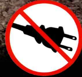
No electricity required